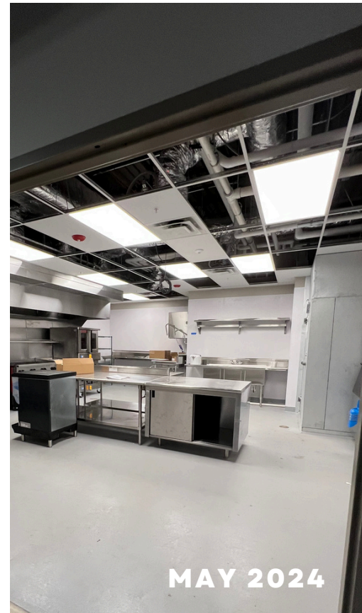
Above: Different stages of our shelter expansion project through the years. Thanks again to all of our partners & donors for generously funding this project!